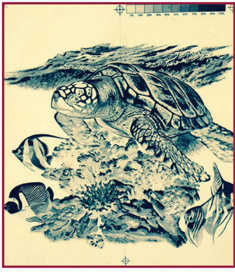
Figure B. Notice the grey scale in the top right-hand corner of the film positive. Exposing this grey scale on each screen for every color is a great way to visually inspect that all the halftone dots from the 5%-100% tonal range are exposed and washed out properly - See more at: http://impressions.issshows.com/

Figure A. Here, 20" x 24" OD static aluminum frames stretched to 20 N/cn were used to print the sea turtle. A 156-mesh was used for the white underbase and 230-mesh for the colors. Notice the amount of detail in the white underbase print. - See more at: http://impressions.issshows.com/screen-printing-designs/Screen-Printing-on-Fleece-8356. shtml#2