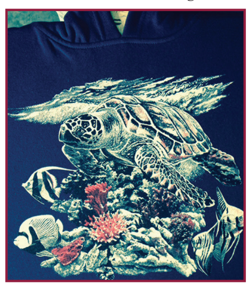
Figure D. Here, you can see the white underbase, black and red. Although there is not a lot of red in the design, it adds a realistic quality. - See more at: http://impressions.issshows.com/

Figure C. The white underbase was printed with a 156-mesh and flashed before printing the remaining five colors, wet on wet, on top of this base print. - See more at: h t t p://impressions.issshows.com/screen-printing-designs/Screen-Printing-on-Fleece-8356.