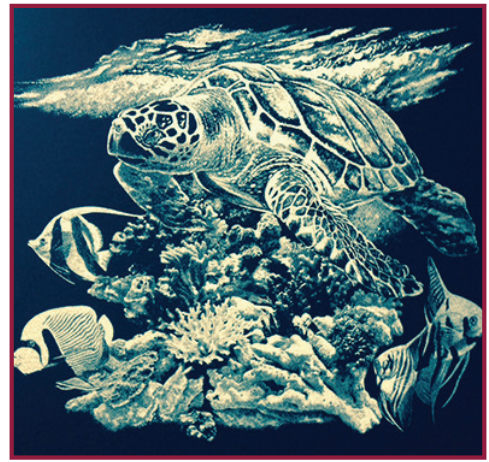
Figure C. The white underbase was printed with a 156-mesh and flashed before printing the remaining five colors, wet on wet, on top of this base print. - See more at: h t t p://impressions.issshows.com/screen-printing-designs/Screen-Printing-on-Fleece-8356.

screen-printing-designs/Screen-Print-ing-on-Fleece-8356.shtml#3